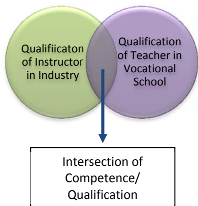
Figure 1. Chart of qualifications and competence of vocational teachers and instructors.

The relationship between the two, where there are similarities and differences, in order to facilitate further understanding can be described as in Figure 1 below.